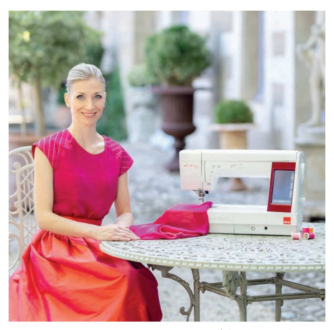
No limits for your style