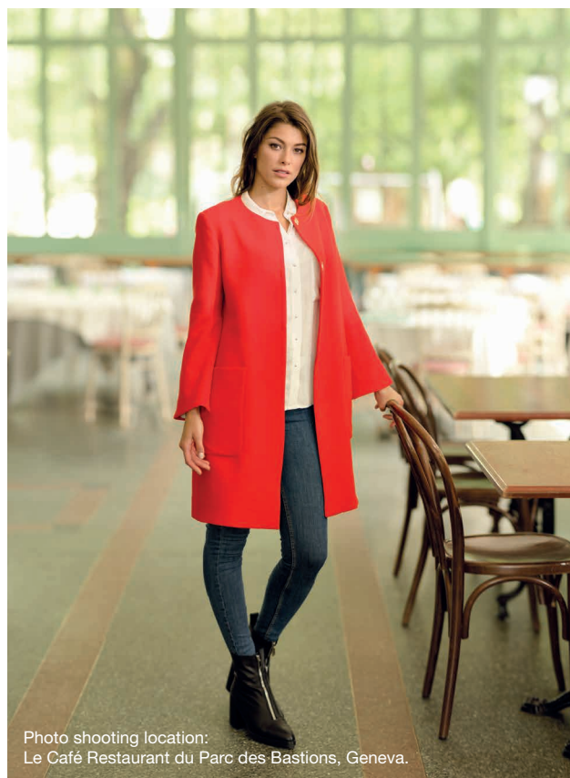
Photo shooting location: Le Café Restaurant du Parc des Bastions, Geneva.

In addition, the version 570α includes an alphabet with lower and upper case characters, numbers and symbols. The memory function of this model enables you to create personal and unique stitch combinations and to program text and names.